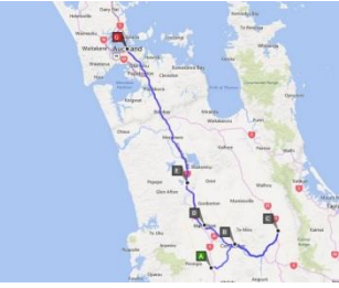
Auckland North Island Otorohanga to Auckland